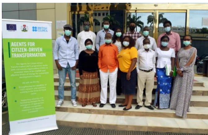
Participants at the M&E training for CSOs in Plateau state.

The four-year programme (2019 – 2023) is funded by the European Union and implemented by the British Council.