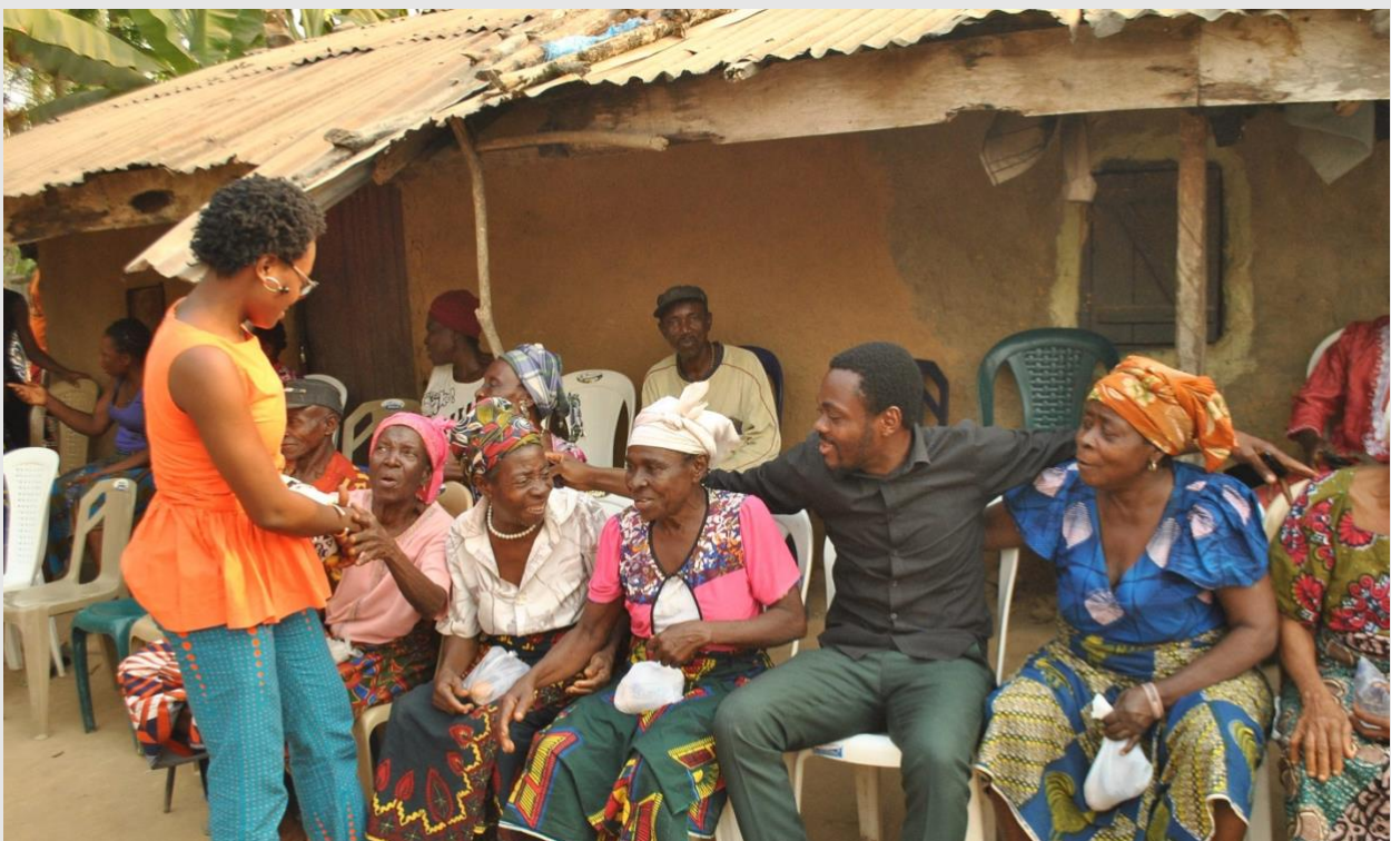
CLICE staff in the field.

For more information: www.clicefoundation.org