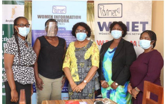
Participants at the M&E training in Edo state.

The initiative augments ACT’s capacity strengthening support for CSOs. With participatory trainings for CSOs, ACT understands that expertise exists within the CSO sector and establishing a standard peer-to-peer learning platform for experience sharing will lead to long-term change for sustainable development.