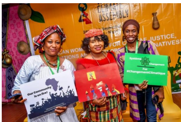
Kebetkache Women Development and Resource Centre Rivers state.

In response to this challenge, Kebetkache partnered with WoMin African Alliance to organise the assembly. The event not only aimed to bring women's perspectives to the forefront but also to amplify their voices, shed light on the gendered impacts of the climate crises, and propose alternative development approaches.