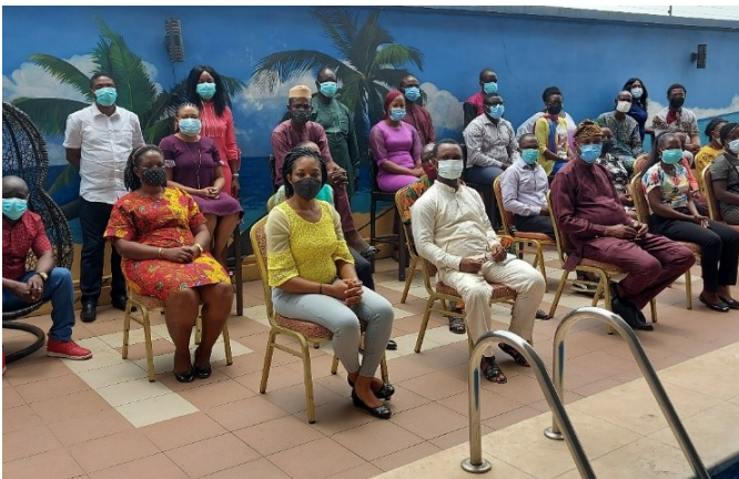
Participants at the training program for CSOs on proposal writing for fundraising activities.

The sessions were delivered virtually (via Microsoft Teams) using a participatory approach in the form of group discussions and tasks. Some of the modules included communications in development, media engagement and management, digital media for social change, and social behaviour change communication.