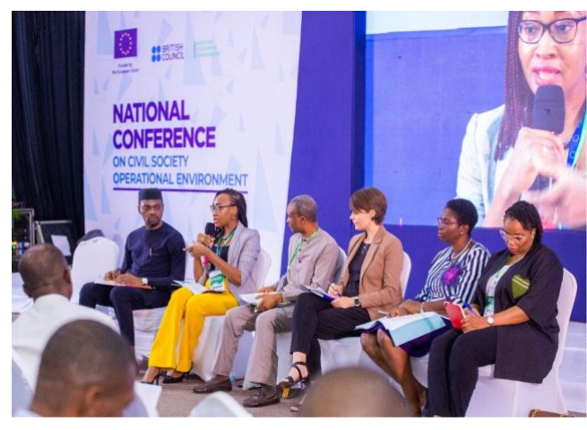
Speakers at the National Conference.

Over 250 stakeholders attended the conference either in person or virtually. Key public officials represented at the event included