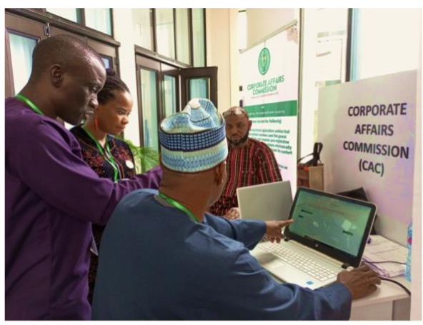
Staff of the Corporate Affairs Commission interact with CSOs.