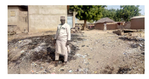
Cleared refuse dumping site, Anguwan Jarawa

system to prevent further dumping on the culvert, thereby reducing the probability of flooding and outbreak of diseases in the community during the next rainy season.