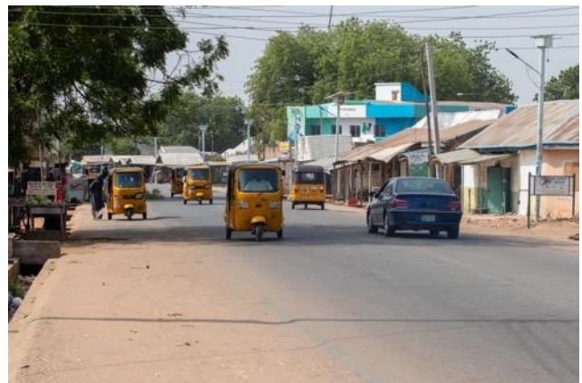
Roads in Yola, Adamawa State.