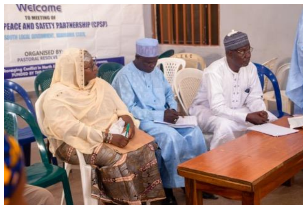
Meeting of the CPSP in Adamawa.

HRH Mai Mustapha Umar Mustapha II, Emir of Biu, Borno State