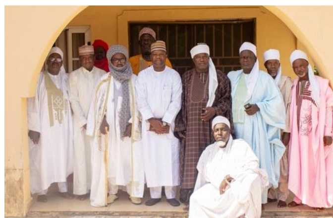
Traditional rulers in Yola.