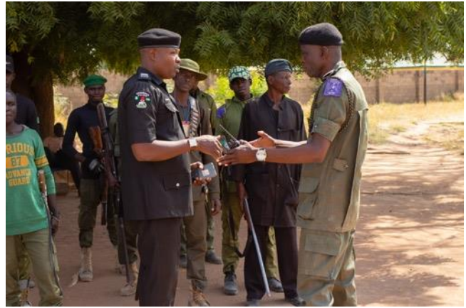
Officers of the police and the voluntary policing service interact in Adamawa.