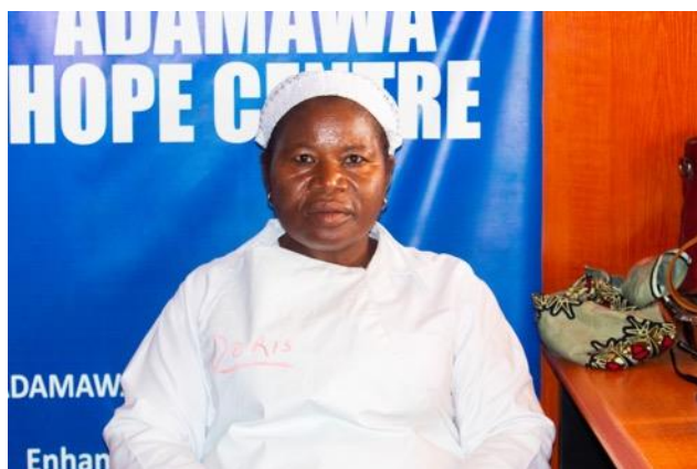
Nurse at the Adamawa Hope Centre.