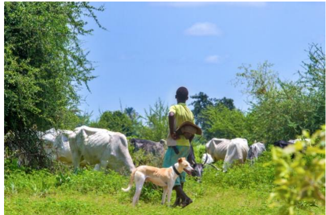
Young farmer in the North East.