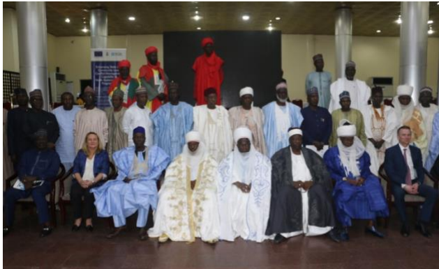
Closure event in Abuja.

Without prejudice to request of the people of the North East for continuation of support, he requested the EU and the British Council to introduce a similar programme in the North West and Zamfara State, in particular, that is among the states worse affected by banditry.