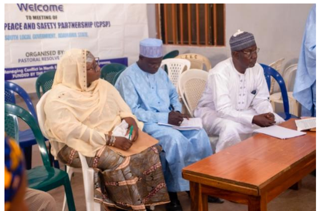
MCN-supported Community and Safety Partnership.