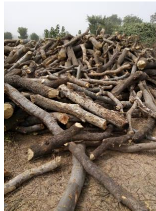
Wood seized by authorities.

Following these actions, feedback from stakeholders at the CPSP meeting held in March indicate that there is a remarkable reduction in illegal wood logging activities in the area.