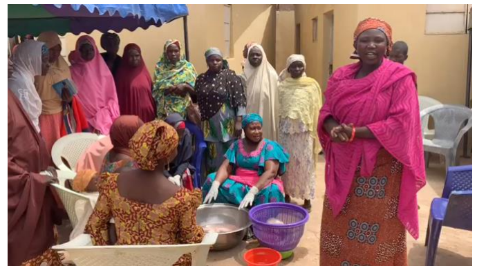
Training of women's groups in Potiskum.

Malama Gambo, Jagana, Konduga LGA, Borno State