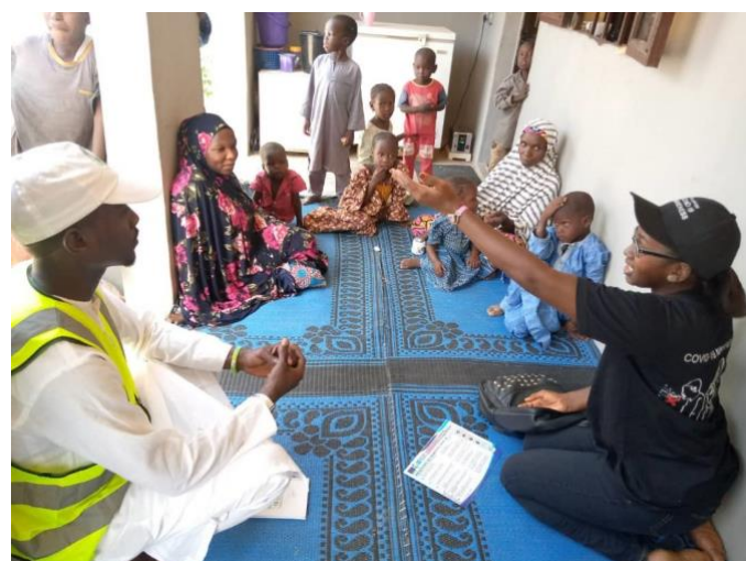
Women targeted by MCN-supported platforms to raise awareness about COVID-19 and prevention strategies.

The Community Engagement and Social Development Initiative (CESDI) - a local CSO implementing a women's economic empowerment programme with MCN support - has also leveraged its platform with key women groups to share handbills disseminating information in local languages on the symptoms and how to prevent the transmission of COVID-19 in Yobe and Borno states.