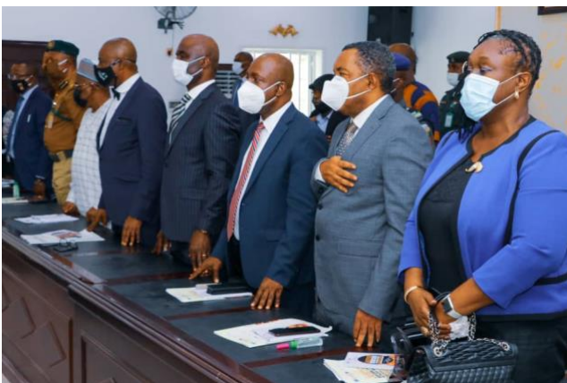
Cross-section of members at the Network of Justice Sector Reform Teams meeting in Abia state.

The five-year programme (2017-22) is funded by the European Union and implemented by the British Council.