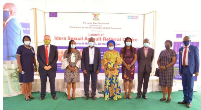
Stakeholders at the launch of the Idera SARC.