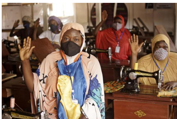
Nigerian women participate in the "I choose to challenge" campaign".