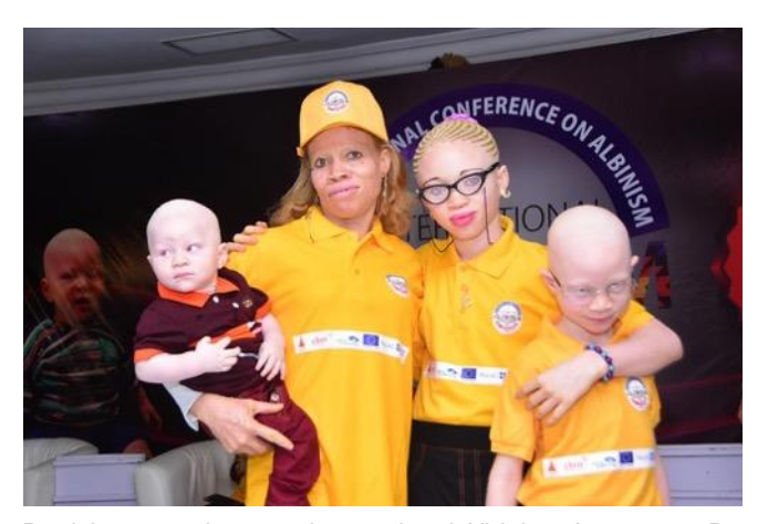
Participants at the 2019 International Albinism Awareness Day

The four-year programme (2017-21) is funded by the European Union and implemented by the British Council.