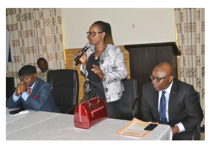
High table at the opening ceremony of the Magistrates retreat

The retreat gave the Magistrates an opportunity to review their work, identify lapses and find solutions to the challenges in administering criminal justice in the FCT. One of the main issues discussed was the implementation of section 34 of the Administration of Criminal Justice Act (ACJA 2015). As was reported in previous newsletters, RoLAC is supporting the FCT Judiciary to implement section 34 of the ACJA, which mandates Chief Magistrates to conduct monthly inspections of places of detention in the FCT. RoLAC initiated its support for implementation by developing templates and guidelines for conducting oversight visits by magistrates and training Chief Magistrates on how to comply with the requirements of section 34.