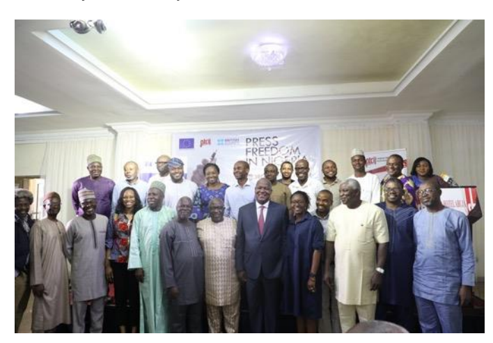
Participants at the World Press Freedom Day event in Abuja

The conferences were a first step in a series of activities that support the development of a legislative agenda for media freedom in Nigeria, as well as a web-based counterterrorism and safety manual for journalists.