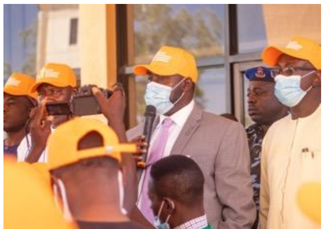
The Speaker of the Adamawa State House of Assembly announces support for the VAAP Act.