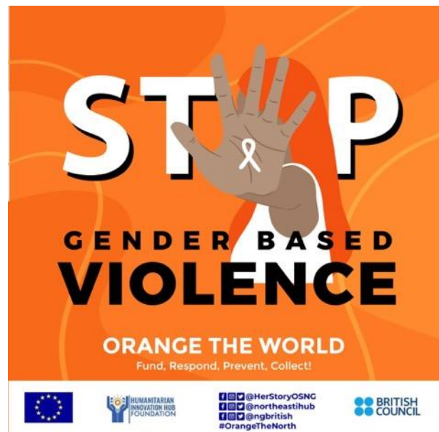
Social media content to promote the 16 Days of Activism Campaign.

The MCN Programme organised a capacity building programme for social media influencers. The workshop, held on 2 nd December, focused on using social media to create awareness about the importance of the 16 Days of Activism campaign and to stimulate conversation around sexual and gender-based violence. The young influencers were trained on the factors accounting for the rising cases of SGBV, ways to identify suspected online predators, warning signs of online sexual offences, and mechanisms for tracking, monitoring, and reporting of suspected cases of violence in social media platforms and networks.