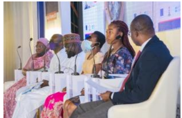
Panelists at the 2020 SARC Network Conference.

The conference was attended by civil society and government representatives, including the Vice President of Nigeria: Professor Yemi Osinbajo (SAN) GCON; the Wives of the Governors of Ekiti, Kebbi and Ondo states; and Commissioners of the Ministries of Women Affairs, Justice and Health.