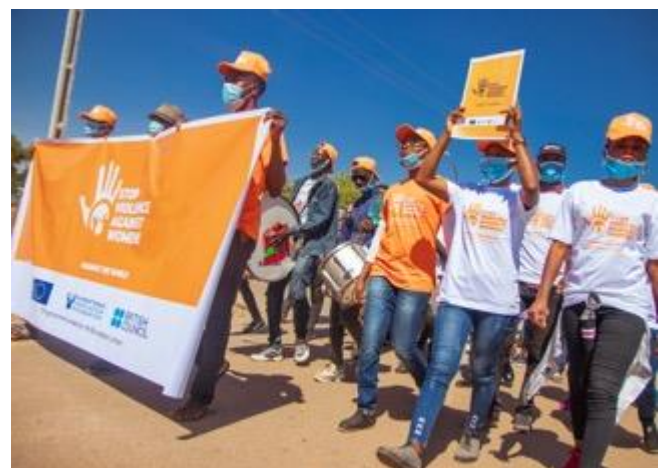
CSOs hits the streets to raise awareness of 16 Days of Activism and advocate for the passage of VAAP Act.