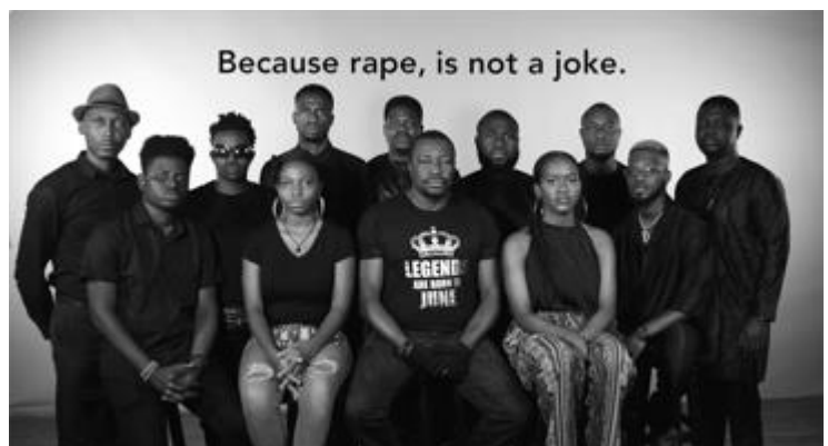
Comedians who participated in the 'Rape is not a Joke' video.

Watch all the videos on the #HerStoryOurStoryNG website .