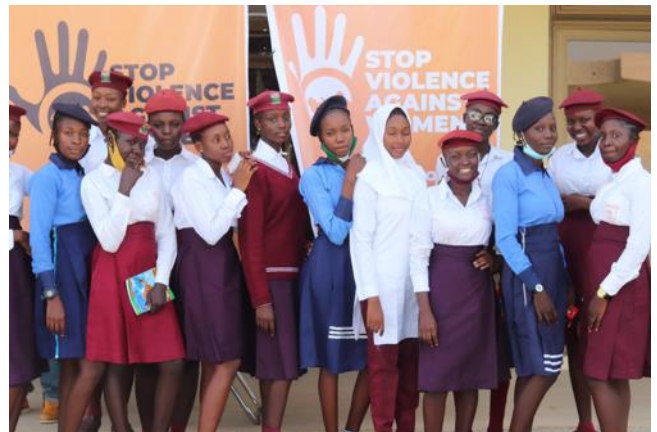
Winners of the quiz competition from the Federal Government Girls College in Yola.

In Yobe state, the MCN Programme supported FIDA and other partners to organise a capacity building workshop for members of the State House of Assembly on the domestication of the VAPP. Following the sensitization, the MCN Programme had also earlier supported the State House of Assembly to organise a public hearing on the VAPP Bill. After the public hearing, the legislature adopted the Bill for second hearing.