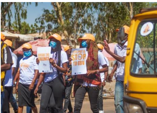
Rally for the 16 Days of Activism 2020 supported the EU-funded British Council programmes in Nigeria.

It is with the momentum created around gender-based violence by the above that the EU-funded British Council Programmes in 2020 joined the world for the 5 th time to commemorate the annual 16 Days of Activism against Gender-Based Violence. The 2020 campaign was unique due to the complications occasioned by the COVID-19 pandemic, which imposed nationwide restrictions keeping citizens inside their homes due to the lockdown measures introduced to curb the spread of the virus. The resultant reports have shown alarming increases in the already existing violence against women and girls.