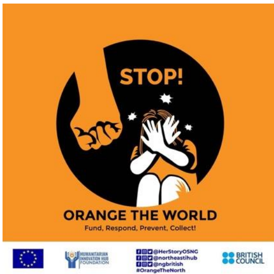
Social media advocacy led by CSOs.