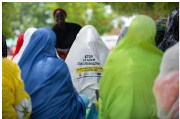
16 Days of Activism Rally.

In collaboration with the Ministry of Women Affairs, FIDA and other relevant stakeholders in the MCN supported SARC Steering Committee, the Bade Emirate Council organised a one-day rally to raise awareness of communities on increasing cases of SGBV in the traditional council. The rally, held on 5 th December 2020 in Bade Yobe State, was attended by Traditional Rulers from districts and villages in the Bade Emirate Council. The Emir used the opportunity of the Rally to launch a foundation that will work with other stakeholders to continue sensitizing the public on sexual and gender-based violence in Bade and Jakusko local government areas (LGAs).