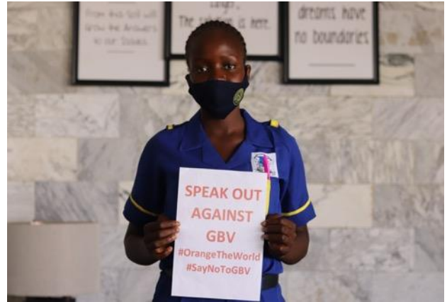
Secondary school student at quiz competition.

There is a now an opportunity to work with stakeholders to encourage multi-agency and multi-sector dialogue towards closing the gap in the delivery of sexual and gender-based violence response services in Nigeria.