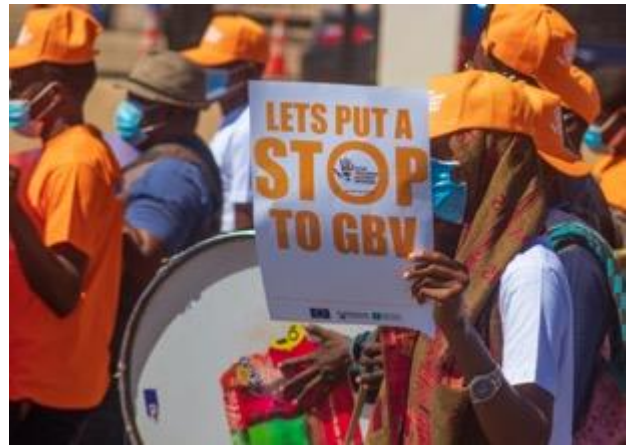
Social media influencers campaign for the 16 Days of Activism

In Adamawa State, the Humanitarian Innovation Foundation (HIF) organised a social media rally to raise awareness on social media platforms during the #16DaysofActivism #OrangeNorth campaigns. Social media influencers were tasked with promoting the campaign on their platforms. An influencer was selected for each major platform: Facebook, Instagram, and Twitter. The influencers posted daily messages on SGBV awareness and activities marking the 16 Days of Activism. The “Orange the World” gift boxes were created to boost awareness of the campaign. The boxes included IEC materials and branded caps and shirts with messages on the theme of the 2020 16 Days of Activism.