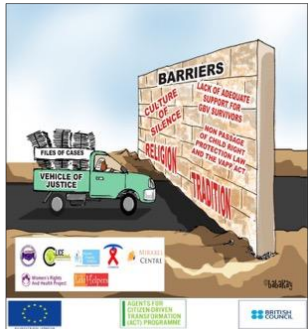
Advocacy materials produced by CSO partners with ACT support.

‘CSOs advocate religious, traditional support systems for SGBV survivors’ , News Diary Online, 9 December 2020